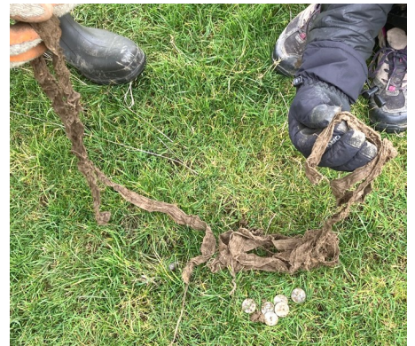
Sometimes, what you find isn't what you expect to find!

The broader historic landscape study is beginning to tell us another story, and so therefore, this trackway investigation will add valuable information in our pursuit of revealing the ancient Mill Farm landscape.