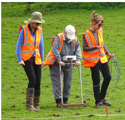
Geophysical re-examination of the previous archaeological dig

On Friday 18th October 2019, The Field Detectives began an investigation into the history of a wooden post mill that once stood on a field to the southeast of Stathern village. One aspect of the investigation involved archival research at the Record Office for Leicestershire, Leicester & Rutland and an examination of