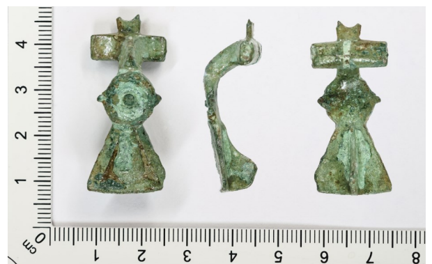
Roman Brooch c. 1st - 2nd Century AD

The next phase of the investigation is to focus on the neighbouring fields to examine the landscape in search of further Romano-British clues and to continue with our broader Medieval and English Civil War investigations.